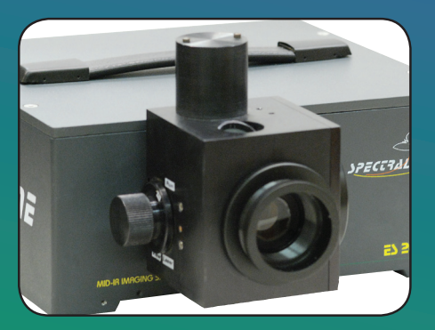
1-D and 2-D scanner for hyperspetral imaging