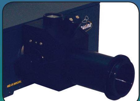
Pointing laser and focus tube