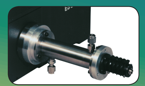
Gas absorption cells