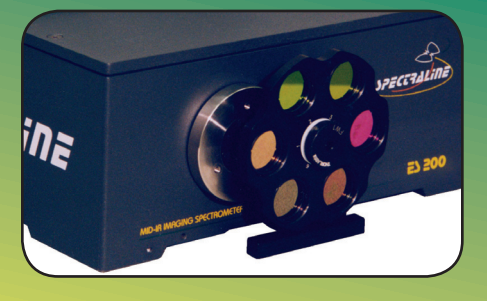
Calibration filter wheel