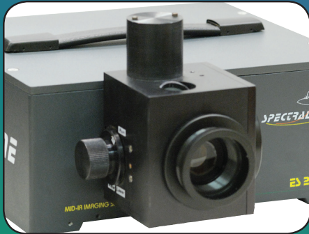
1-D and 2-D scanner for hyperspectral imaging