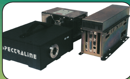
PXI data acquisition system