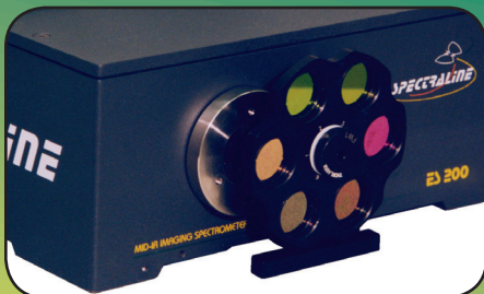
Calibration filter wheel