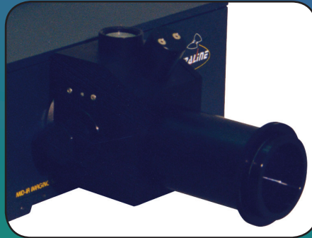
Pointing laser and focus tube